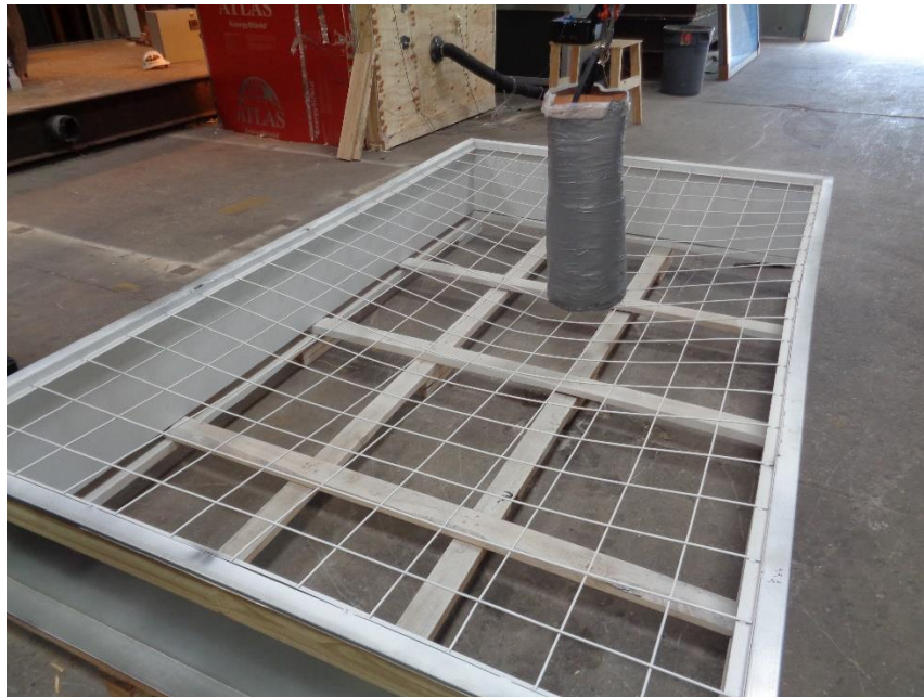
Photo No. 2 Test Specimen During 400 lb. Load