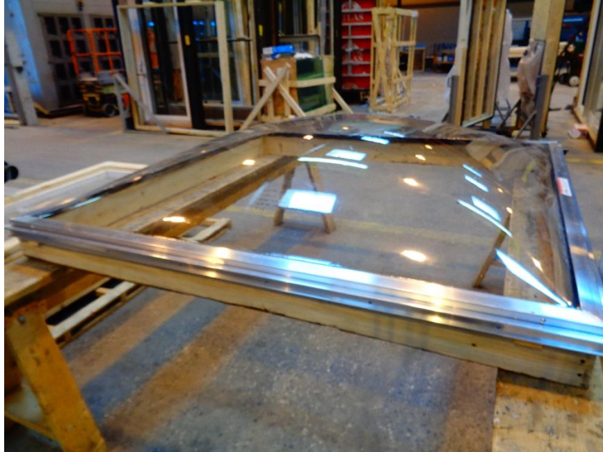
Photo No. 1 View of Tested Specimen