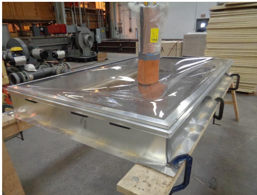
Photo No. 2 View of Tested Specimen with 400 lb Load Applied