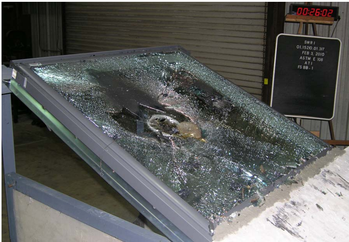
Figure B-4. Condition of Sample at End of Test.