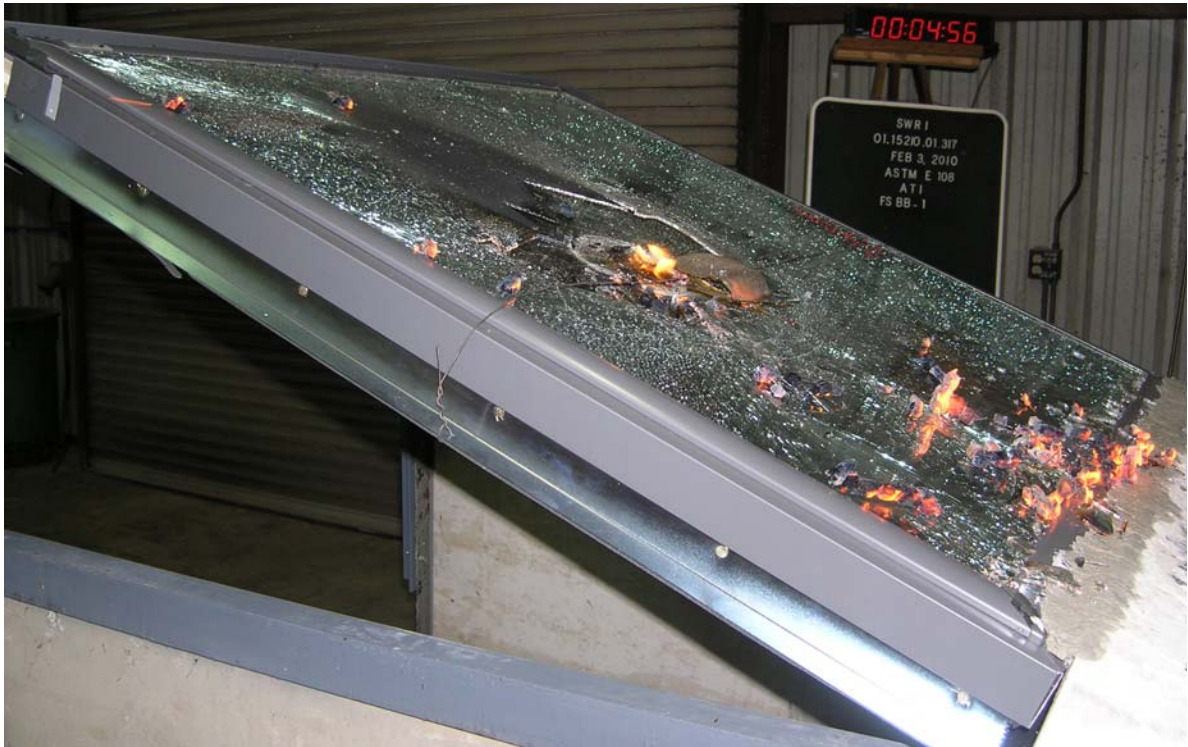
Figure B-3. Condition of Sample after Shattering of Top Layer of Glass.