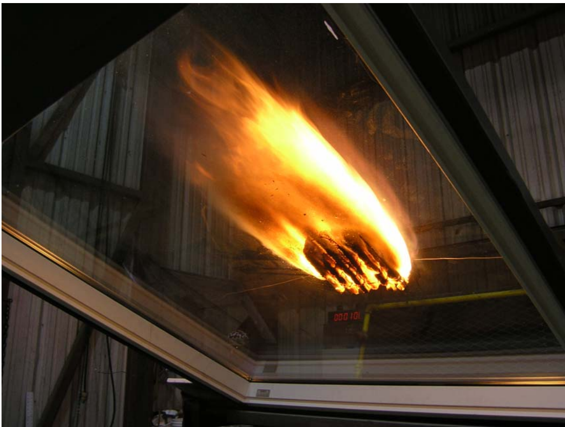
Figure B-2. View of Brand No. 1 from Underside of Skylight.