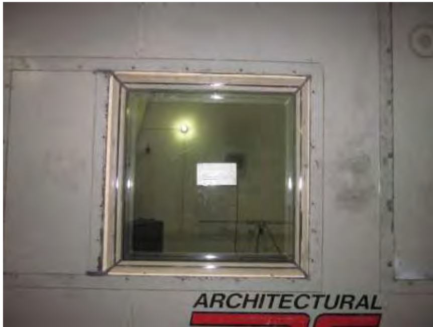
Receive Room View of Installed Specimen