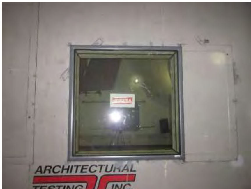
Source Room View of Installed Specimen