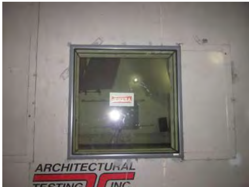
Source Room View of Installed Specimen