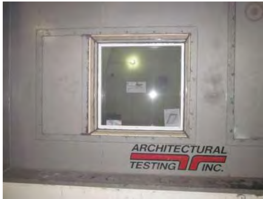
Receive Room View of Installed Specimen