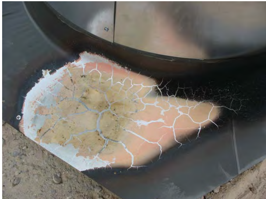
Photo No. 10 Tubular Daylighting Device #2, Test A - Damage to Specimen