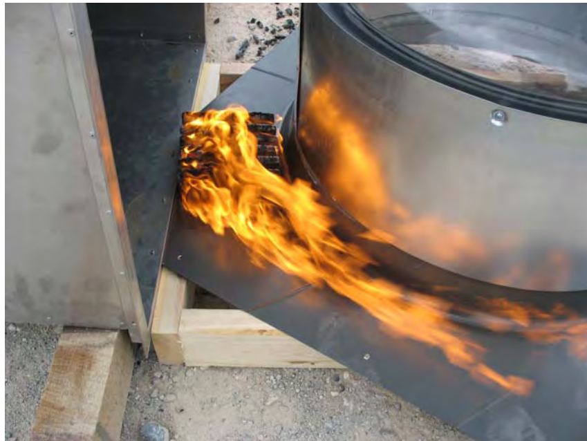
Photo No. 8 Tubular Daylighting Device #2, Test A - Testing in Progress