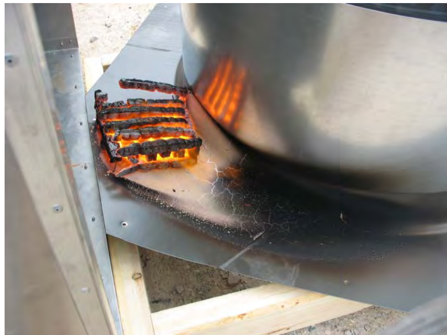
Photo No. 2 Tubular Daylighting Device #1, Test A - Near the End of Test