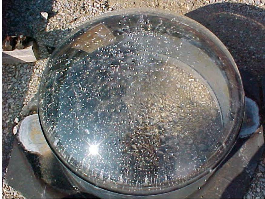
Photo No. 7 Tubular Daylighting Device #1 - View of Plastic Portion