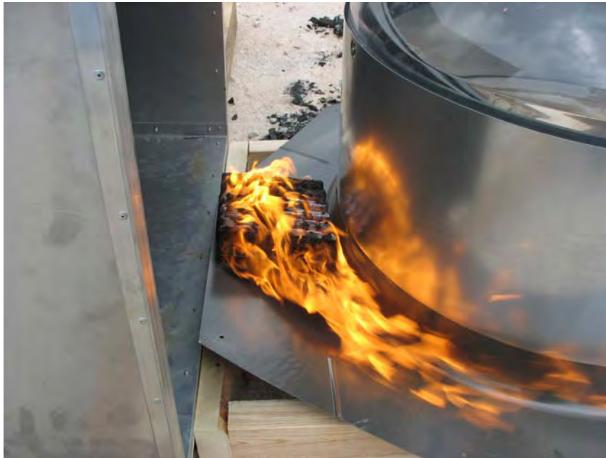
Photo No. 4 Tubular Daylighting Device #1, Test B - Testing in Progress