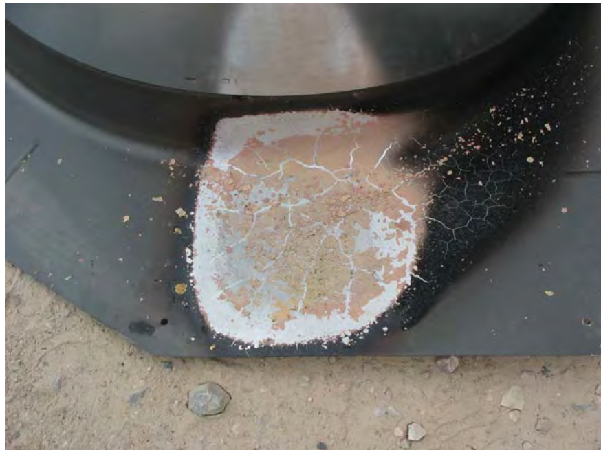
Photo No. 6 Tubular Daylighting Device #1, Test B - Damage to Specimen