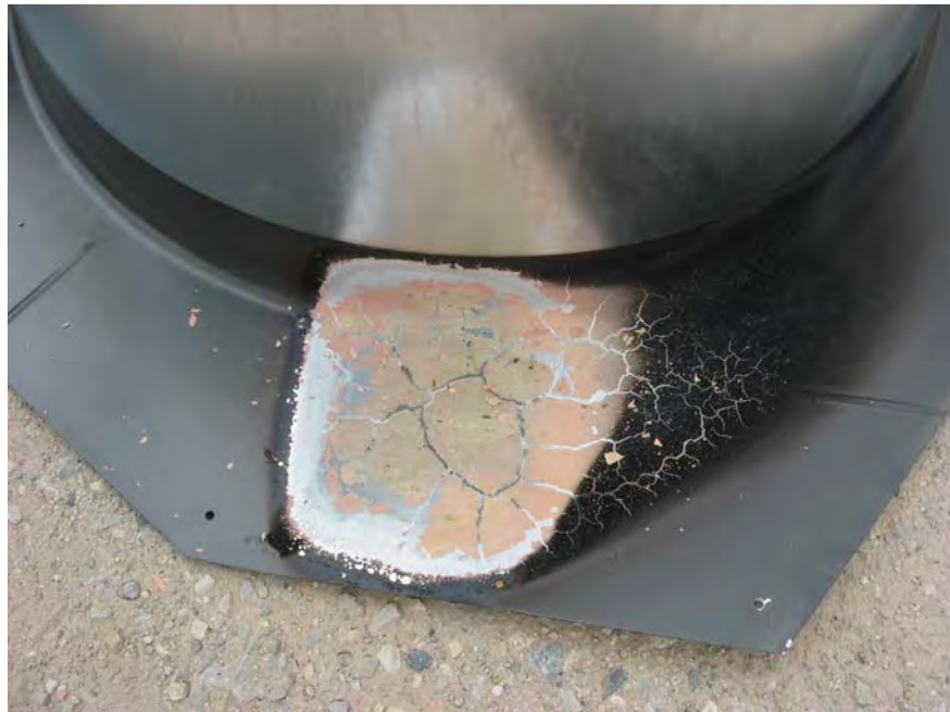
Photo No. 12 Tubular Daylighting Device #2, Test B - Damage to Specimen