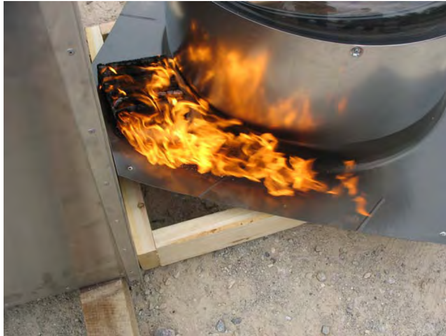
Photo No. 1 Tubular Daylighting Device #1, Test A - Testing in Progress