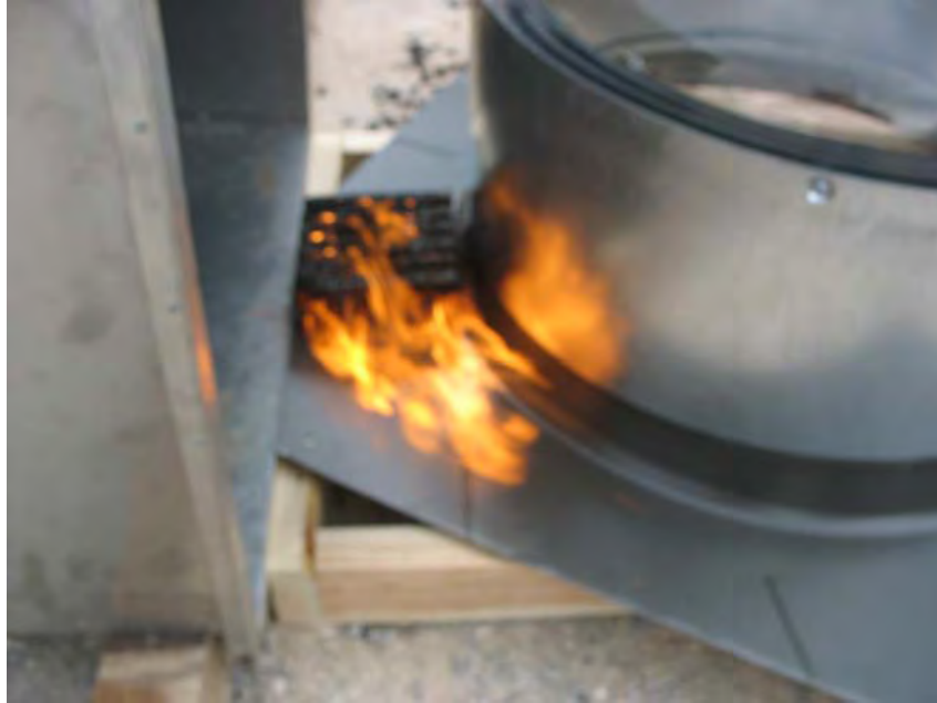
Photo No. 11 Tubular Daylighting Device #2, Test B - Testing in Progress