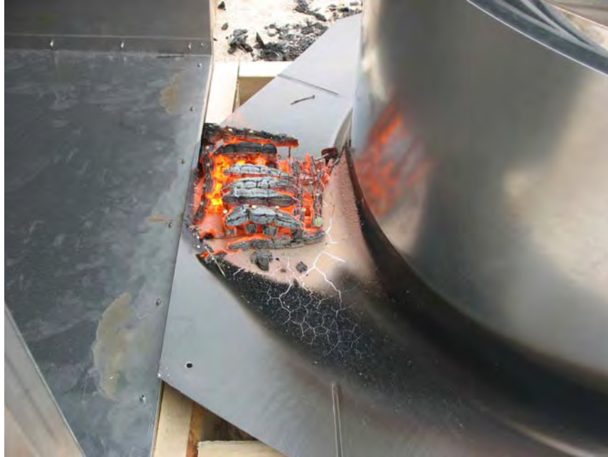
Photo No. 5 Tubular Daylighting Device #1, Test B - Near the End of Test