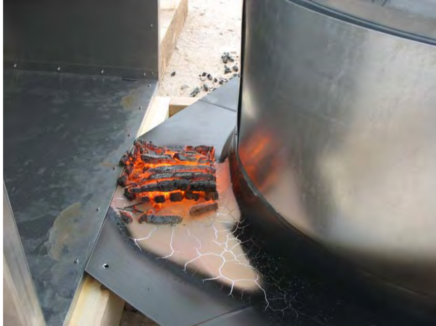
Photo No. 9 Tubular Daylighting Device #2, Test A - Near the End of Test