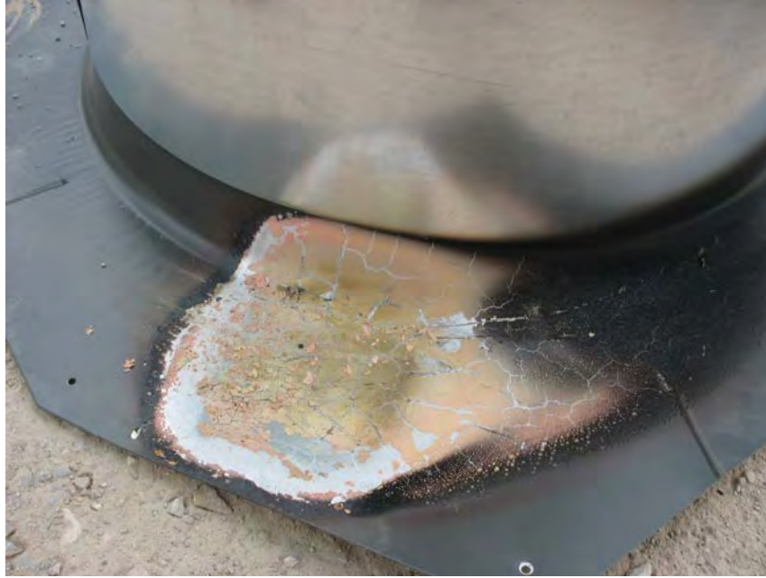
Photo No. 3 Tubular Daylighting Device #1, Test A - Damage to Specimen